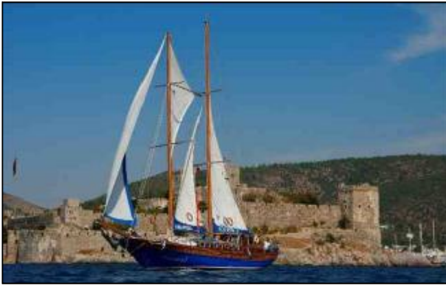
ABOVE ONE OF THE YACHT WHICH WE WILL ATTEND TO RALLY.

WOODEN YACHTS SAILING BODRUM, LEROS XEROKAMPOS, PATMOS SKALA, LEIPSOI, LEROS LAKKI, KALYMNOS, KOS, TURGUTREIS, BODRUM