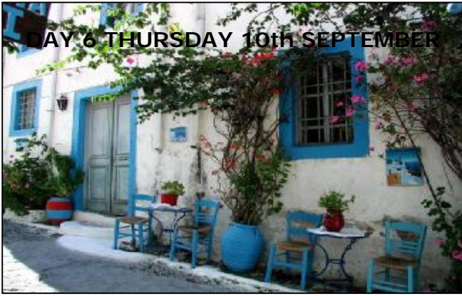
DAY 6 THURSDAY 10th SEPTEMBER

AFTER BREAKFAST SWIMMING AND LUNCH. SAILING TO KOS ISLAND. DINNER ON BOARD. AFTER DINNER ATTENDING A COMMON MEETING WITH KOS ROTARY CLUB