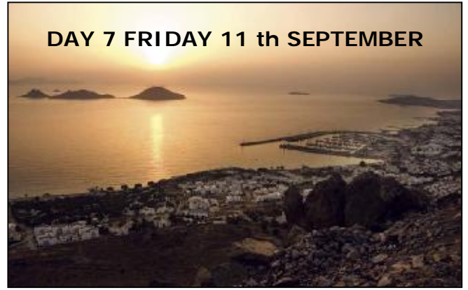
DAY 7 FRIDAY 11 th SEPTEMBER

AFTER BREAKFAST SWIMMING AND LUNCH. SAILING TO KOS ISLAND. DINNER ON BOARD. AFTER DINNER ATTENDING A COMMON MEETING WITH KOS ROTARY CLUB